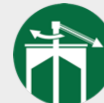
Swivel gravity to either side