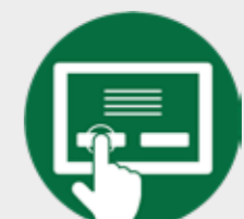
Automated (touch screen)