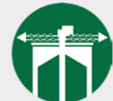
Twin: electric horizontal auger to both sides