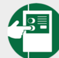
Manual (push button)