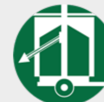
Gravity grain cleaner