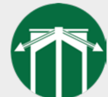
Gravity to both sides