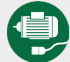
3 phase electric drive