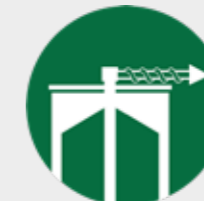
Single: hydraulic or electric horizontal auger to either side