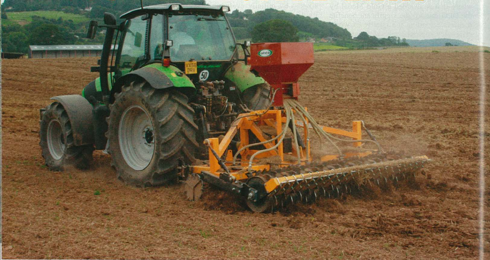
Planting oilseed rape with the Shakaerator and seedbox. Seed is placed at the optimum depth 10mm behind each cultivator leg.